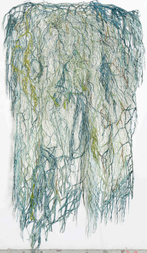
Ethereal Landscape , 2026 Acrylic paint, cotton thread and scrim, galvanised steel wire. 150 x 180 x 4.5 cm EUR 5,500 (net)