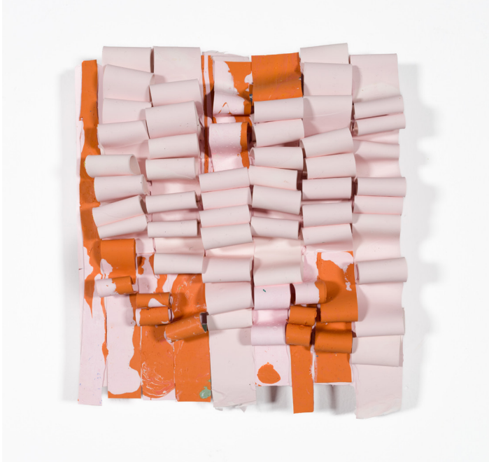
Peeled Paint #16 2024 Acrylic on board 24 x 20 x 6 cm EUR 800 (net)