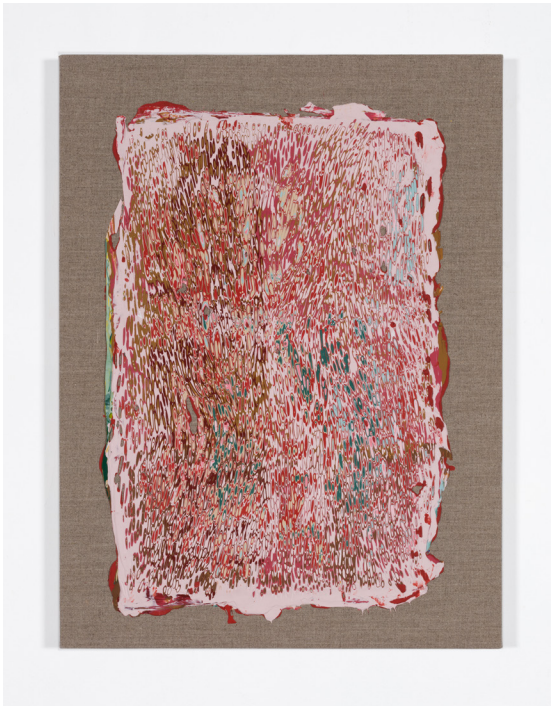
Under Paint-Layers , 2025 Acrylic paint on Belgium linen 60 x 45 x 3.5 cm EUR 1,800 (net)