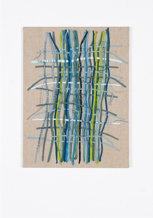
Weaving and Threading II , 2024 Woven acrylic paint and cotton thread on belgium linen. 40 x 30 x 2.5 cm EUR 1,200 (net)