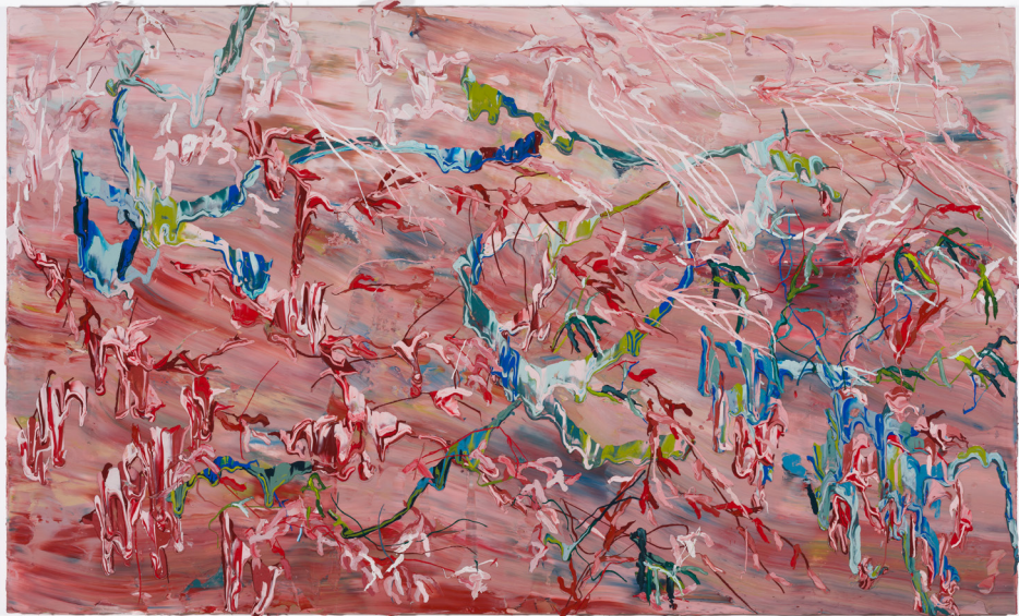
The Melting Point , 2025 Acrylic paint on canvas, stretched over board. 120 x 200 x 4.5 cm EUR 5,500 (net)