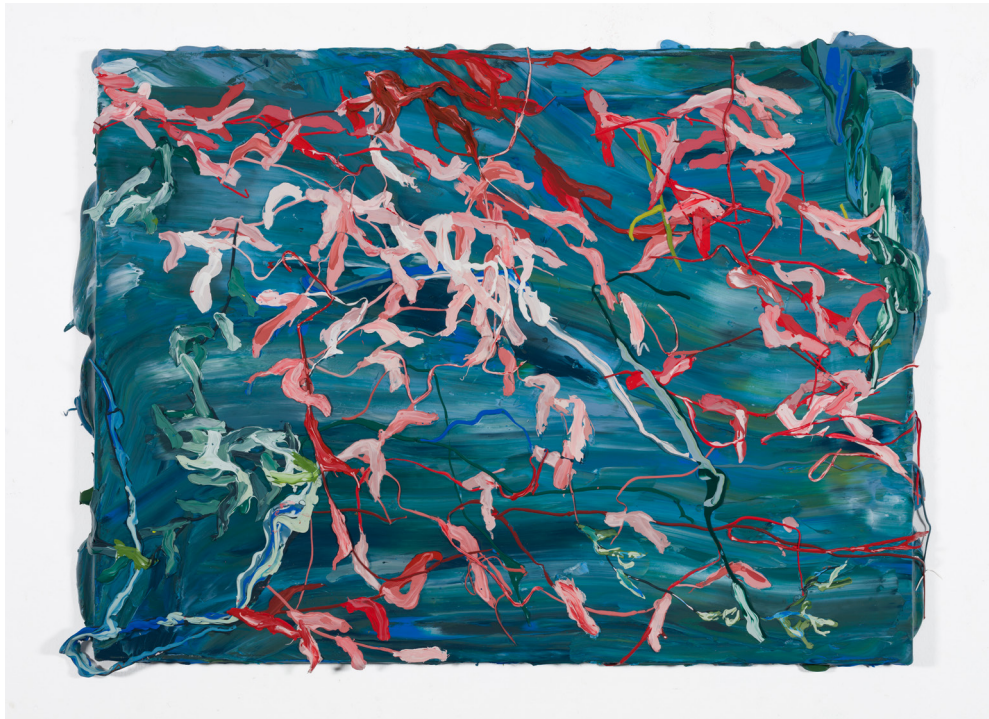
Caught in Meander 2026 Acrylic paint on canvas 85 x 65 x 4,5 cm EUR 3,000 (net)