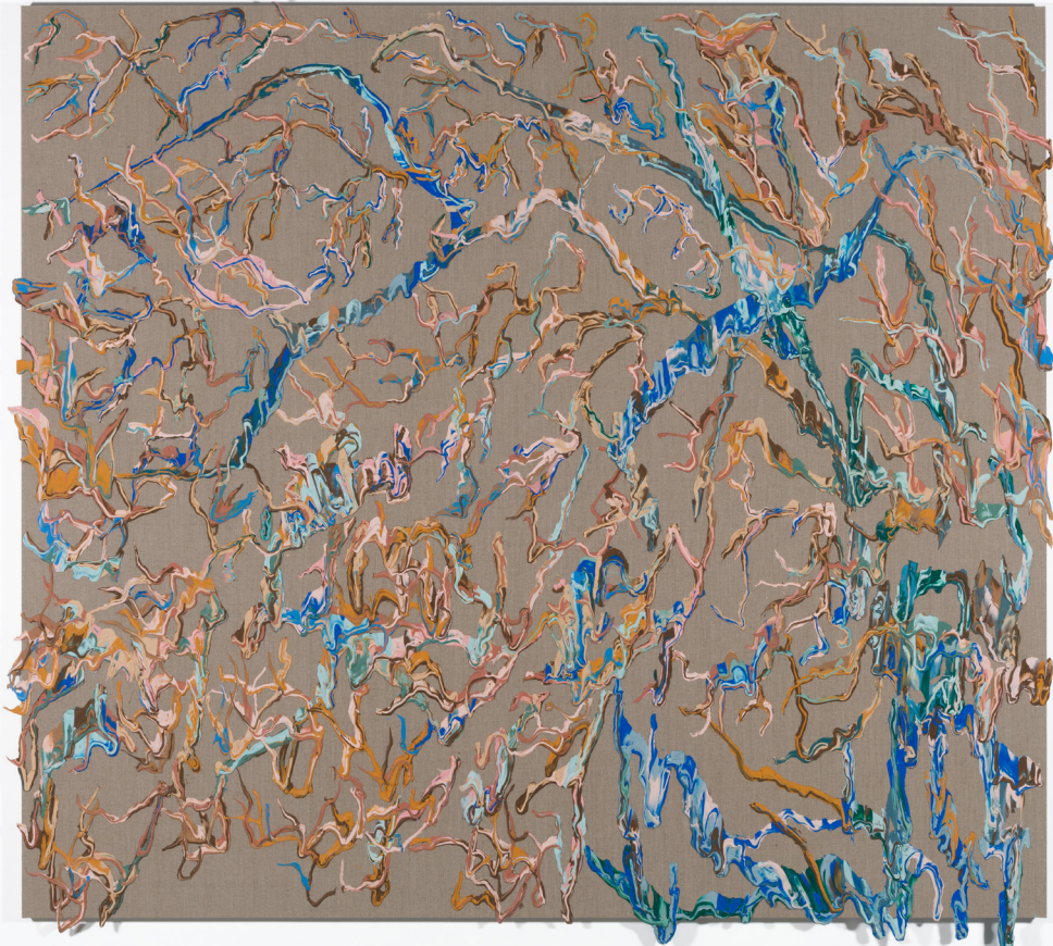
Ungrounding Terra , 2025 Acrylic paint on canvas, stretched over board. 180 x 200 x 4.5 cm EUR 7,000 (net)