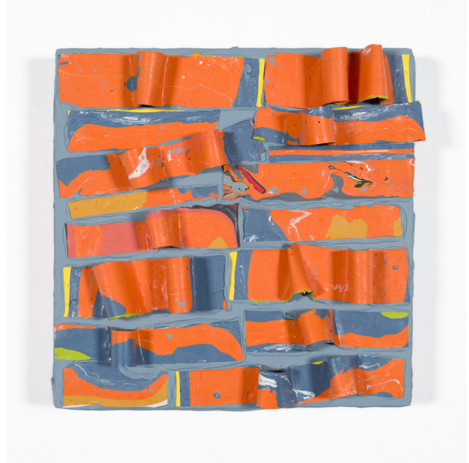
Peeled Paint #16 2024 Acrylic on board 20 x 20 x 5.5 cm EUR 800 (net)