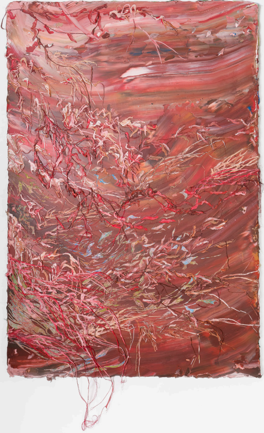
A heat that swept all across everywhere , 2026 Acrylic paint and cotton thread layered on board, carved and collaged. 150 x 180 x 4.5 cm EUR 5,400 (net)