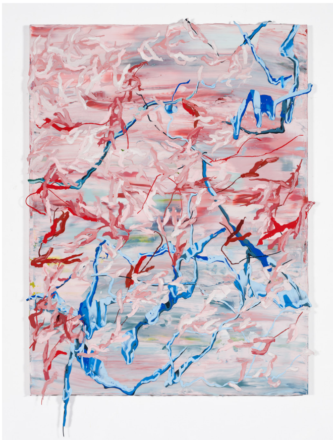
Billowing Breeze , 2025 Acrylic paint on canvas 110 x 78 x 3.5 cm EUR 3,500 (net)