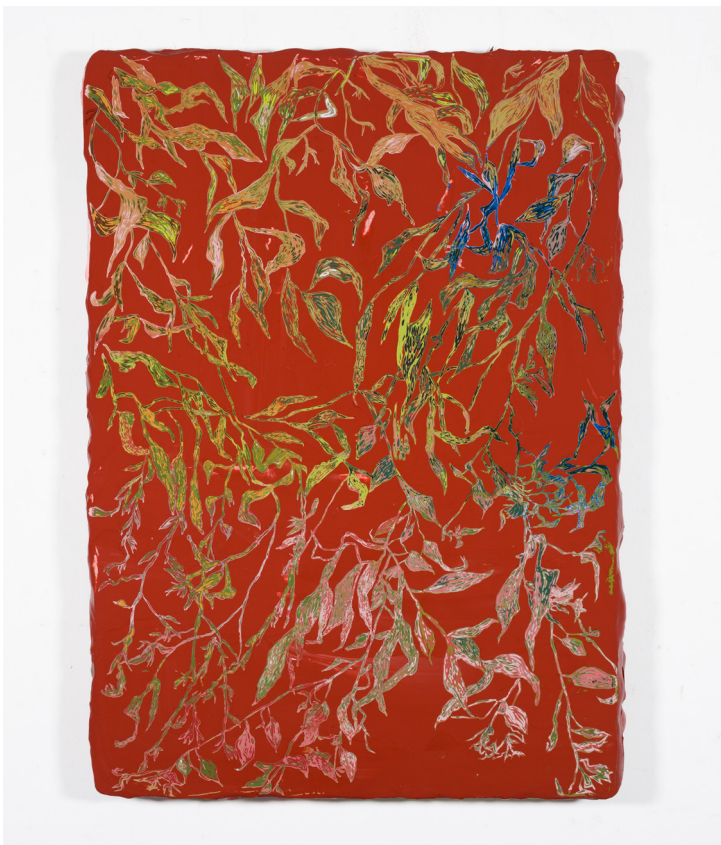
Humming soft sounds to my garden to make it grow, II, 2025 Acrylic paint layered on board, carved. 85 x 65 x 4,5 cm EUR 3,000 (net)