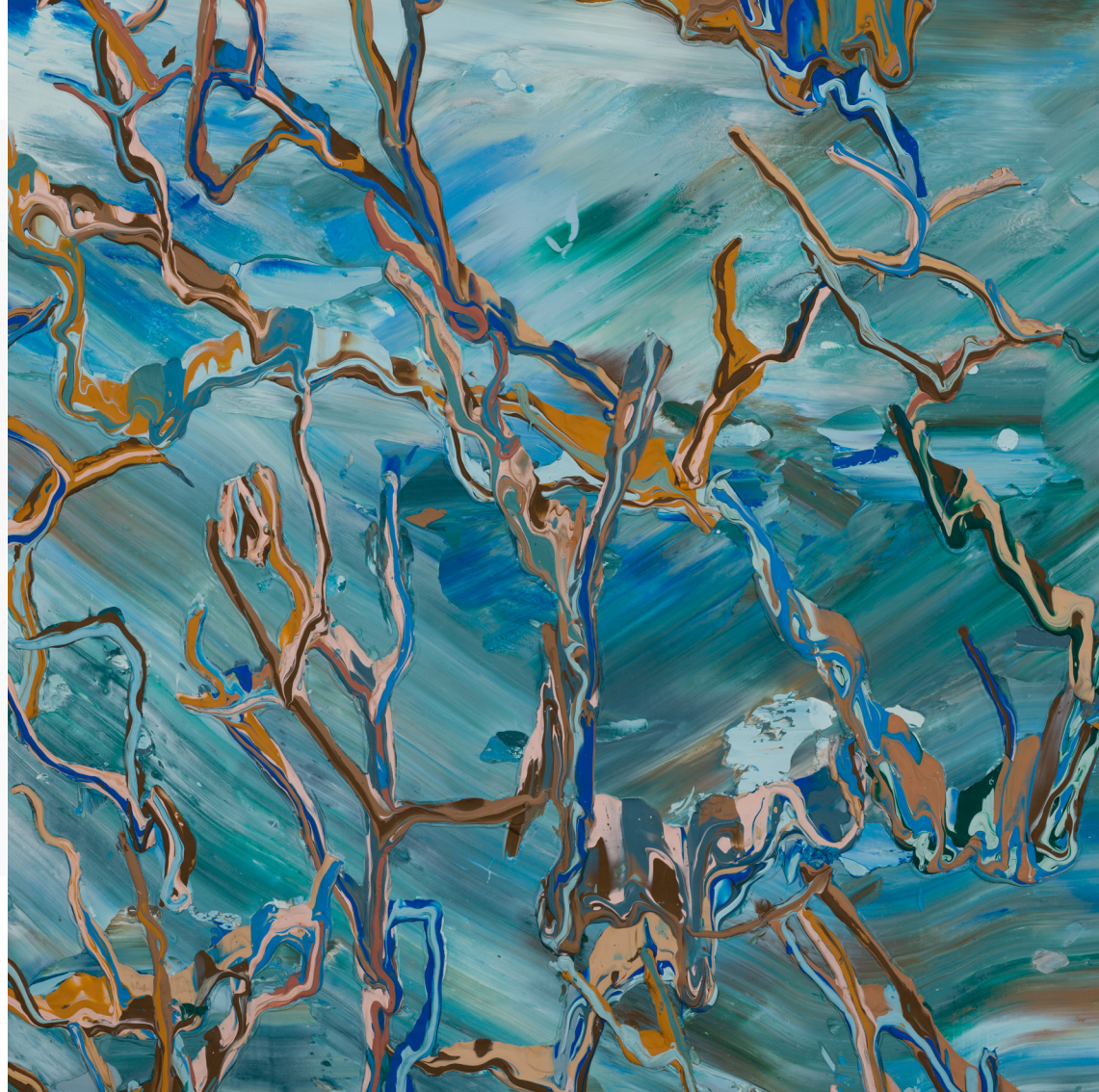
It all blurs under water, 2025 Acrylic paint on canvas, stretched over board. 115.5 x 90.5 x 3.5 cm EUR 3,500 (net)