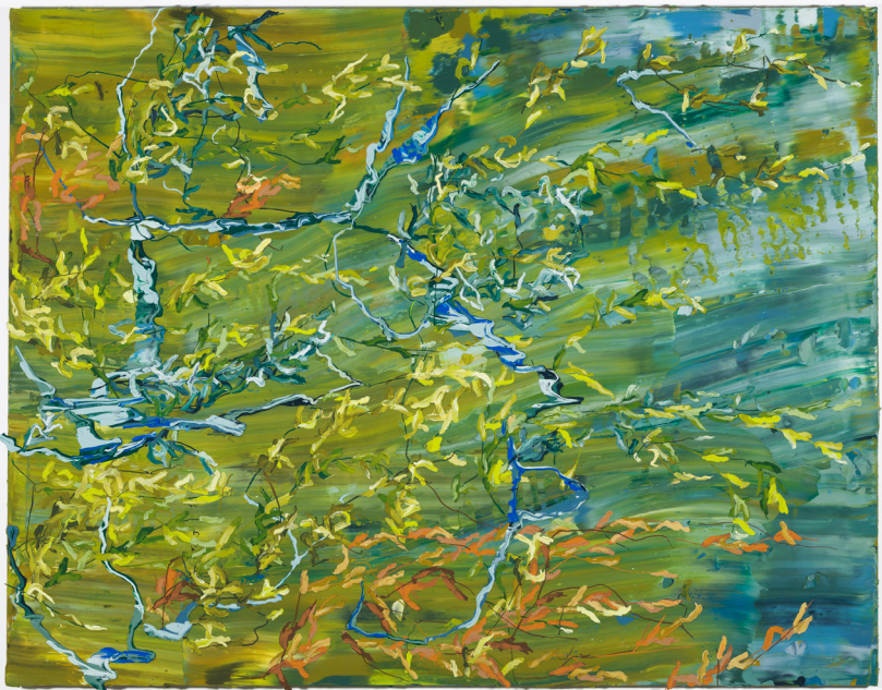
Season Stirring, 2025 Acrylic paint on canvas, stretched over board. 180 x 140 x 4.5 cm EUR 5.800 (net)