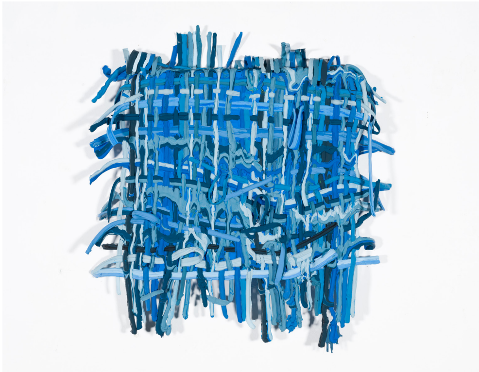
Melting Blues , 2024 Acrylic paint on board 60 x 60 x 9 cm EUR 2,100 (net)