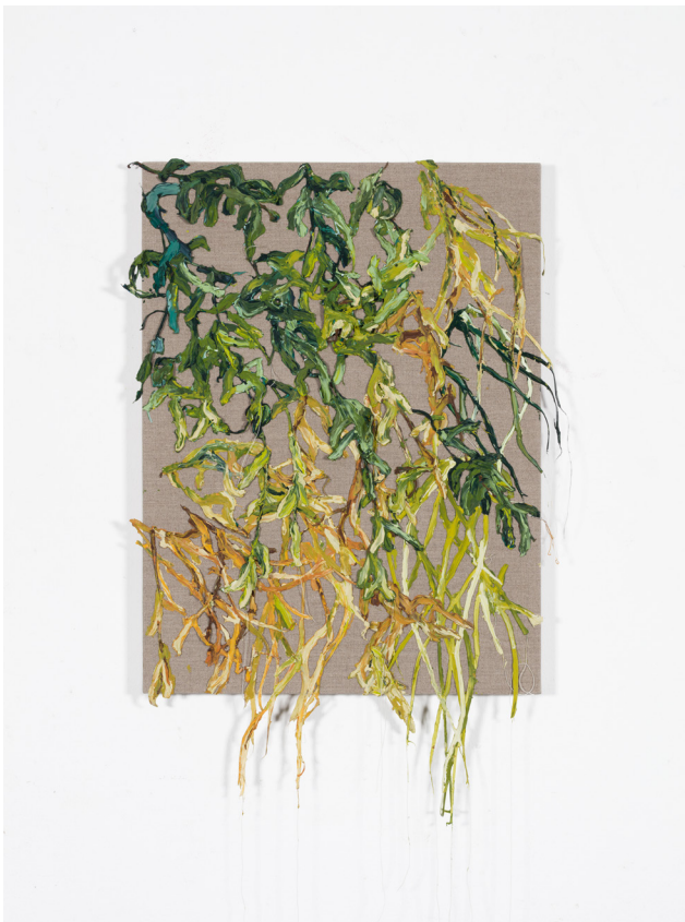
In Time, Leaves Will Fall, II, 2025 Acrylic paint on Belgium Linen. 60 x 54 x 3.5 cm EUR 1,950 (net)