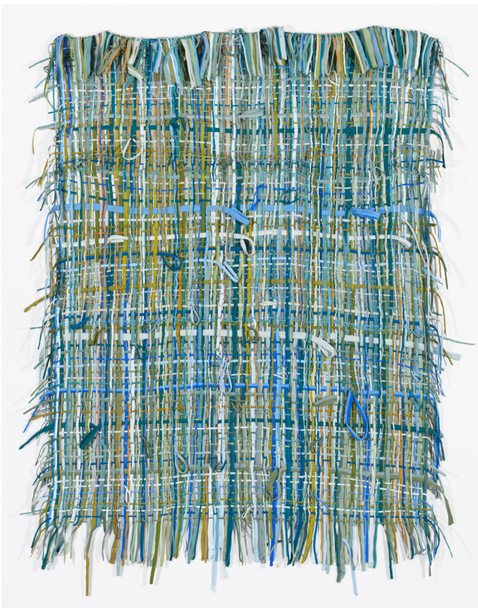
Woven Paint(ing) in Blue and Green, 2024 Acrylic paint with stainless steel wire 180 x 205 x 6 cm EUR 6,500 (net)