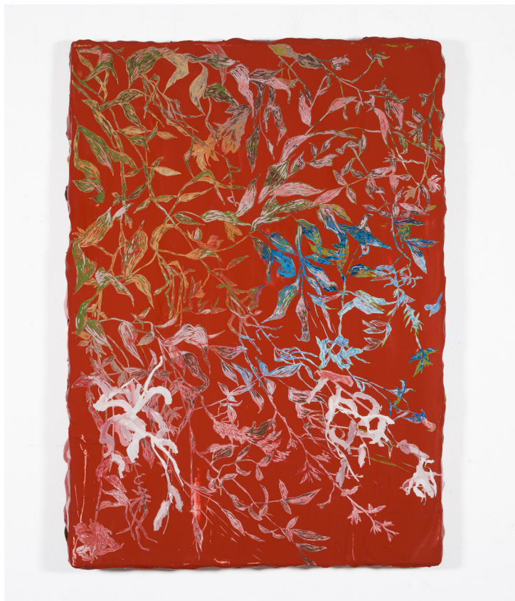
Humming soft sounds to my garden to make it grow, 2025 Acrylic paint layered on board, carved and collaged. 85 x 65 x 4,5 cm EUR 3,000 (net)