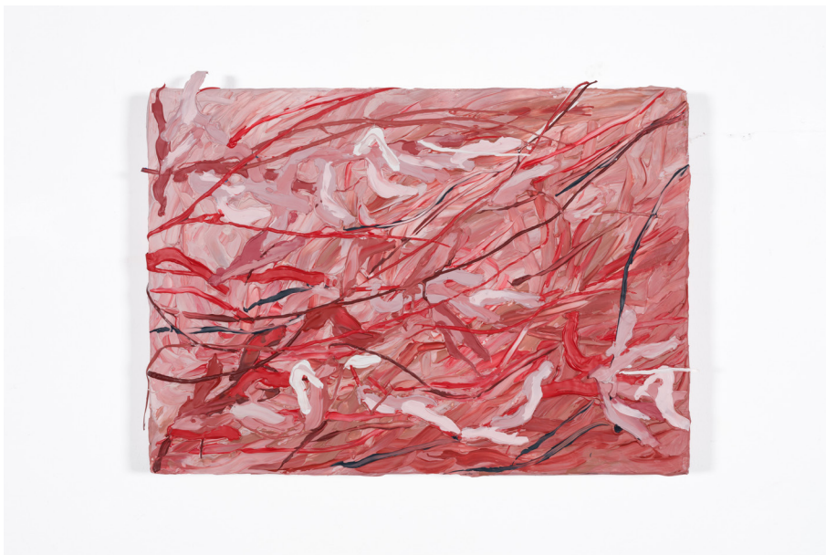
Blazing Blossoms , 2025 Acrylic paint on board 30 x 41 x 3.5 cm EUR 1200 (net)