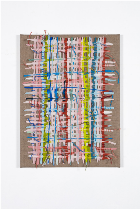
Dipped & Stitched , 2025 Acrylic paint on Belgium Linen 40 x 30 x 2 cm EUR 1200 (net)