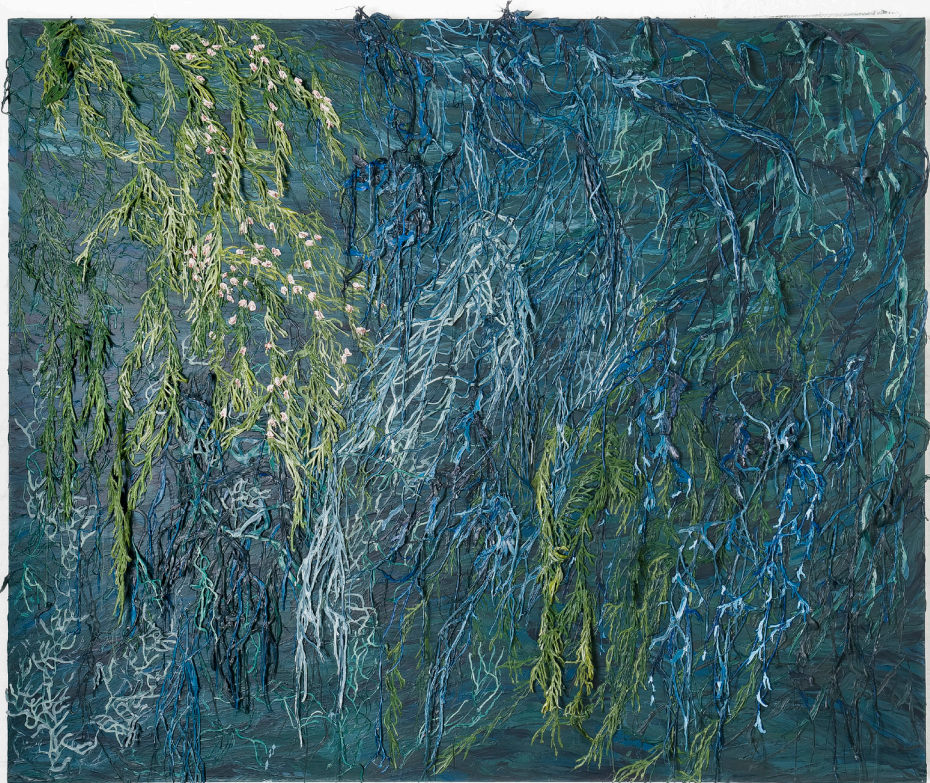
Then Drifting Deeper , 2026 Acrylic paint and cotton thread on canvas, stretched over board 150 x 180 x 4.5 cm EUR 5,800 (net)